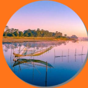
Majuli the land of Satras