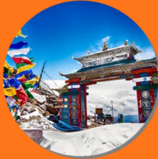
Tawang the hidden Paradise