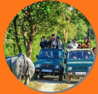
Pobitora wildlife sanctuary