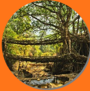
Meghalaya abode of the clouds