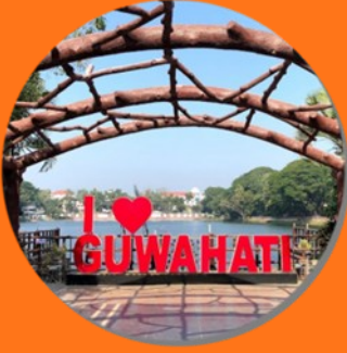
Guwahati City Tour