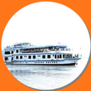
River Cruise on Mighty Brahmaputra