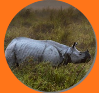
The Wilderness of Kaziranga